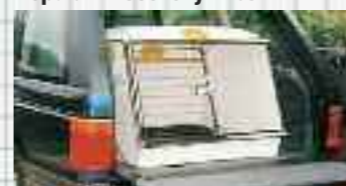
DB10 Ranger Hi-Top in Range Rover.