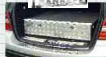
TRANSAFE in Mercedes M Class