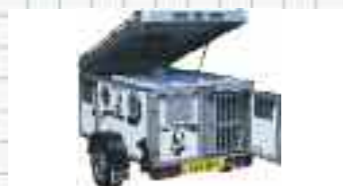
Thermo insulated trailers from stock with fans and storage