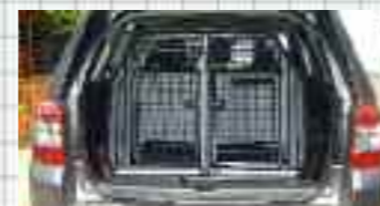
DB2006 in Freelander 2