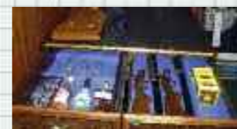
Inside drawers, many options