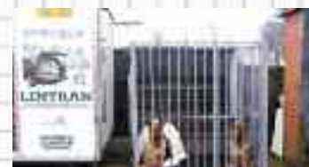
Strong Kennel Runs Available in galvanised bar or mesh if required.