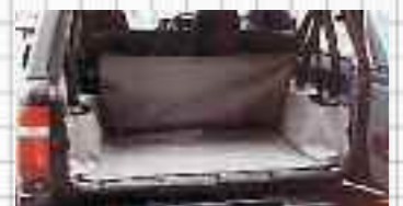
Vinyl liner, made to measure.