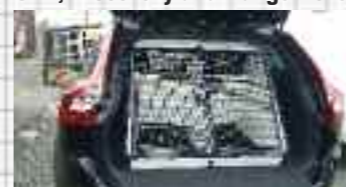
DB11 hi-top in Volvo XC60 also fits Range Rover Sport