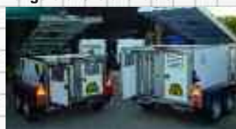
4 berth trailer options. Your choice of height from stock.