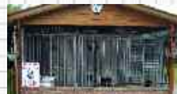
Log cabin and thermally insulated kennels