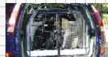
DB2006 in Zafira also fits Freelander 2 and Sorento