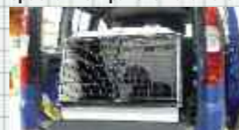
DB9 Trooper Hi-Top in MPV. Popular Discovery 1 box.