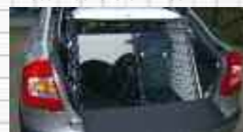
DB11 HiTop in Skoda Octavia