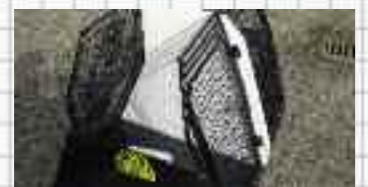
Combi liner and tailgate