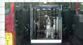
New Land Rover