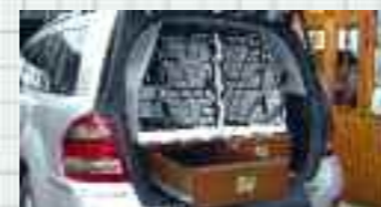
Mercedes GL box and drawers