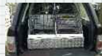
Range Rover and Transafe