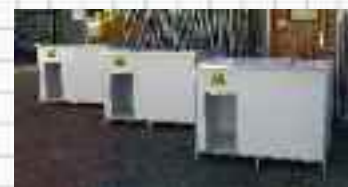
Kennel boxes made to any size