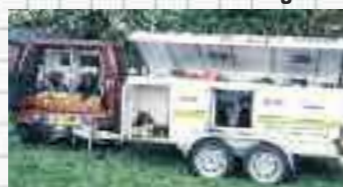
5 berth trailer, twin axle. Large trailers available.