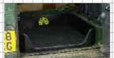
Custom made liner to suit