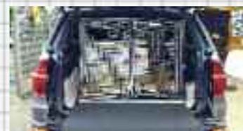
DB10X in BMW X5 also fits CRV, Discovery and Range Rovers option