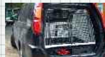
DB2000 in X-Trail