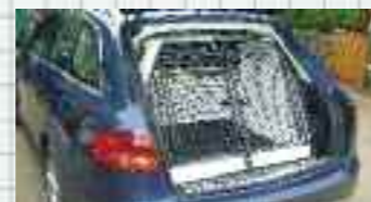
2004 in Audi A4