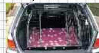
Black Box in BMW estate