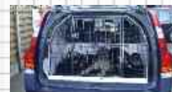
GSD pup in Volvo estate Volvo