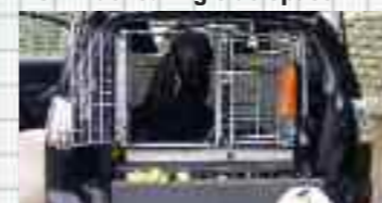
DB6 Lindale in Lincolnshire Fire Service Outlander