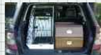
Range Rover Sport, custom box and side drawers