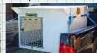
Combination work and play, tools in the week dog at weekends