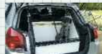
DB2 Lindum in Signum and fits many hatchbacks