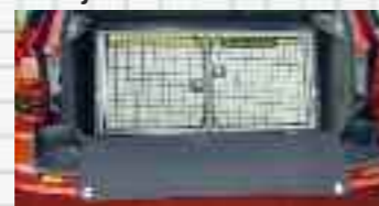
DB1 in small hatch