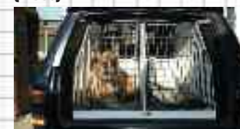
X-Trail, Surf and Terrano styles