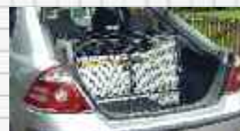
DB3 in Mondeo. DB2 and DB12 also fit.