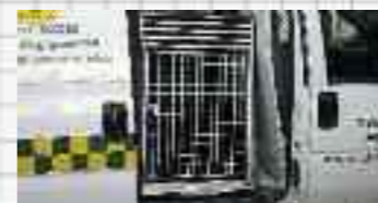
DB15 Single Van Box galvanised