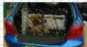
DB3 in 307 hatchback