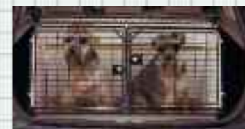
DB1 Linton in Fiesta