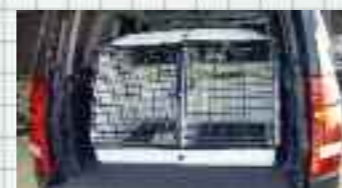
DB7 HT in new Discovery