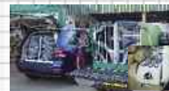
Toureg and Pickup with store (inset)