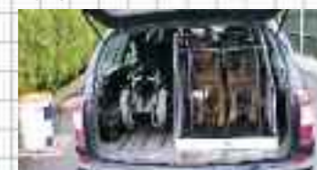
Omega box for GSDs with space