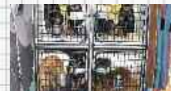
Show Team in MPV