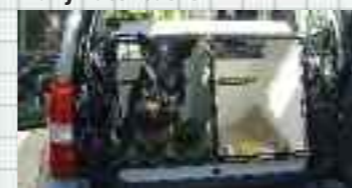
DB3 Tracker Hi-Top in 4x4. Fits many estate cars.