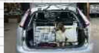
DB3 in Golf hatchback