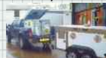
Simon Tyers choice Navara 3 in 1 option and trailer