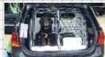
2004 in BMW 3 Series