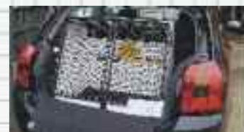
DB14 hatchback. We can modify this to suit car - 27"