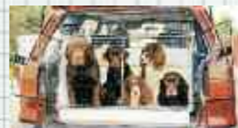
DB7 London in Land Cruiser shows extended mesh hi-top