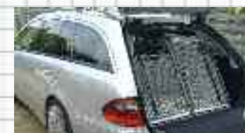
Mercedes Estate