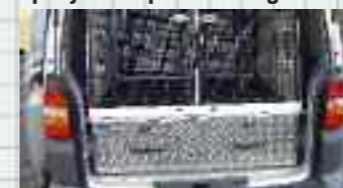
Vito drawer and box option