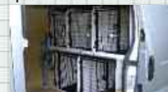
Custom fit-out with escapes or spray on or plastic linings