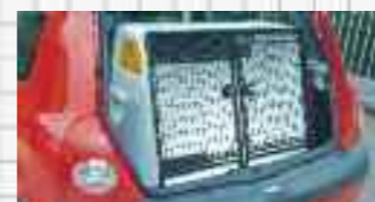
DB14 Hatchback in Toyota