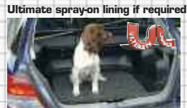
Ultimate spray-on lining if required.