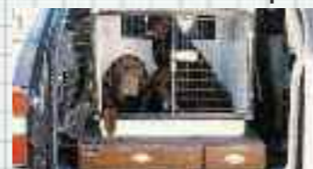
DB8 Shogun in Land Cruiser optional view panel on drawers