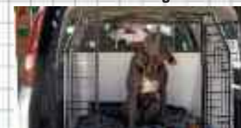
Maximum height box for Great Dane in MPV