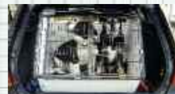
DB12 Tourer Deluxe in V40 also fits BMW 3 series