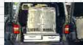
DB3000 in van with storage