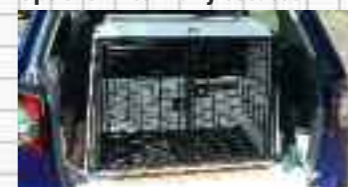
LINFLAT Small in Golf Plus