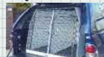
Isuzu Rodeo custom box