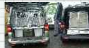
VW Transporter box and store options