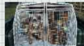
DB2000 Galvanised with bulldog