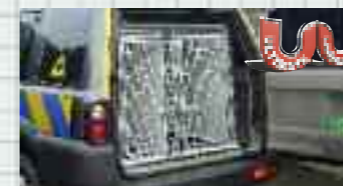
DB3000 in Freelander commercial