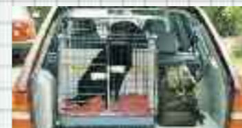
DB5 Rover in Mercedes Estate 29" wide leaving side space.