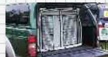
DB2000 Long in Navara