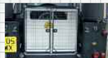
DB14 Freedom in Land Rover