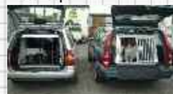
Linflat fits many estates