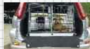
DB3 in 206 Station Wagon