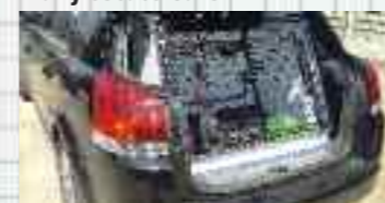
DB4 Lincoln in Signum. Taller estate model.