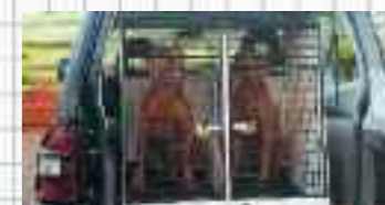
Maximum height ideal for these Weimaraners in Shogun