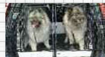
DB2004 in Volvo V50 also fits Audi A4 and A6