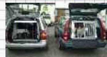
LINFLAT Normal and Aluminium Options. Fits many estates.