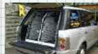
Range Rover Custom, max size