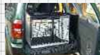
DB3 in Rav 4