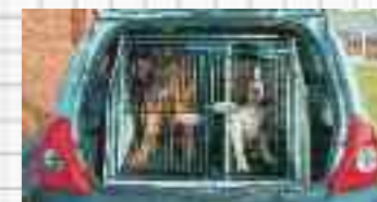
Collapsible box for maximum room in a small car