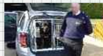
DB2000 in Astra Estate