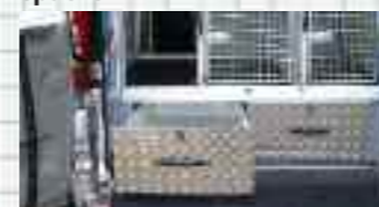
Made to measure large store options