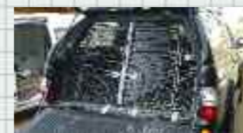
Tailgate and divider in Hi-Lux or Ranger