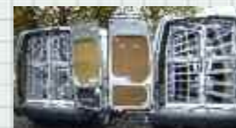
UK Border Force multi dog option. Electric fans fitted.