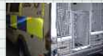
Van fit-out option MOD