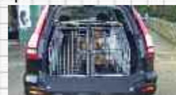
DB2000 in Volvo XC90