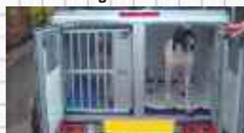
New style trailers with extra storage. 2 berth shown.