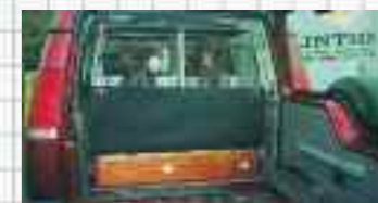
Custom and Drawers in Discovery TD5