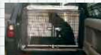
DB13 Cadet in Freelander