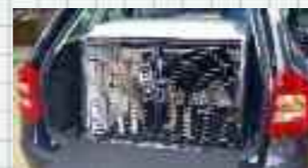
DB6HT in Skoda Octavia Skoda